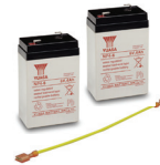
Replacement Batteries (BP002-000K)